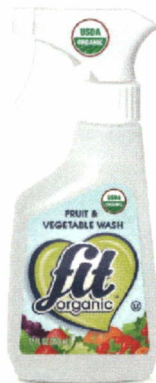
FIT Organic® 12 oz. Spray Produce Wash