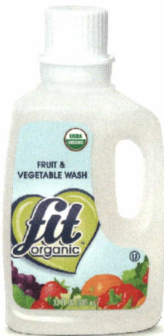
FIT Organic® 32 oz. Soaker/Refill Produce Wash